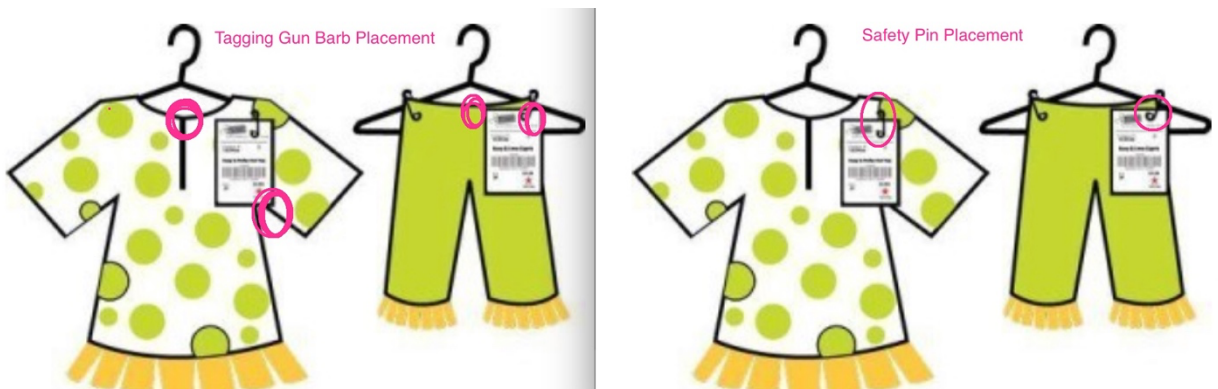
Tagging Gun Placement - Left Image; Safety Pin Placement - Right Image